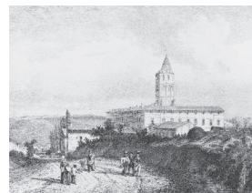
The abbey, from the Langoiran road.

The network of Compostela routes is far denser than the four main routes recorded in the 12th century in "The Santiago de Compostela